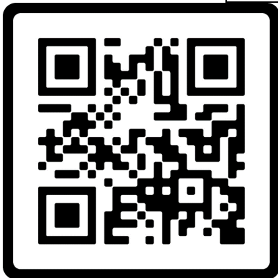
Course Map QR